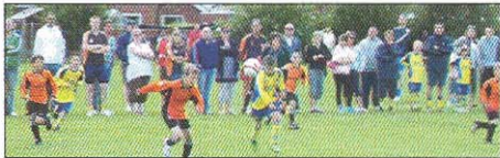
Tournament 2010 action

all, but to win it three years in succession is unbelievable and outstanding, perhaps their policy of giving every child regardless of ability or lack of, a chance to play football over trying to get a team that wins Cup etc perhaps should be the policy that other Clubs might try, mine and the league's congratulations go to Hykeham Tigers, we are very proud of you."