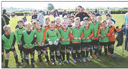
Tournament Tigers Under 8