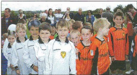
Tournament Tigers ready